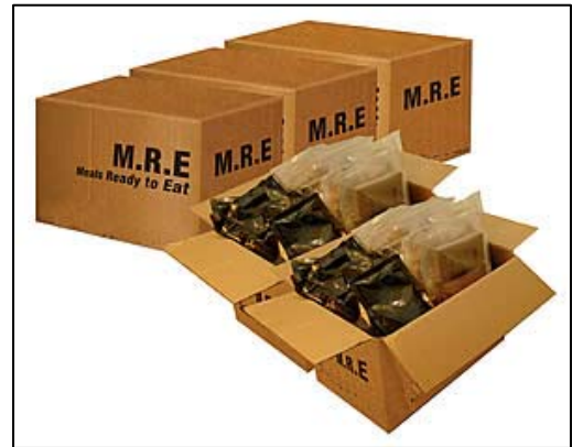
M.R.E. Field Ration packs

For every nation's army and disaster victims. Comes with our FRH flameless ration heaters