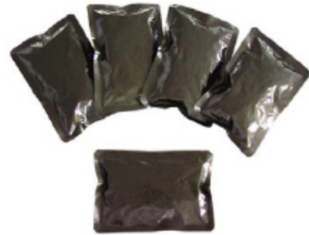
Entrée pouches (Army Green)