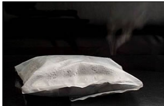
Flameless Ration heater (FRH)