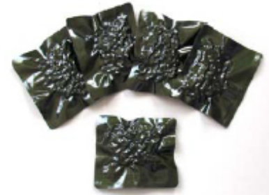
Vacuumed pouches for accessories