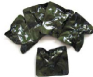
Semi-vacuum pouches for accessories