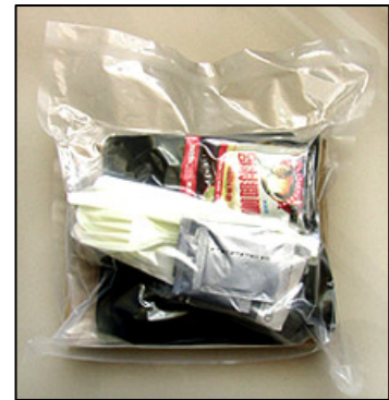
Lightweight HALAL Ration Packs

Each unit comes with a waterproof vacuum pack. All items HALAL and are manufactured in accordance to HACCP and ISO9001 standards.