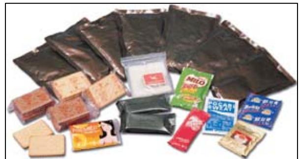
Combat Ration Packs and accessories Long shelf life characteristics Applies to all components including accessories

We are committed to serving our clients with the utmost diligence – we provide cost-effective, reliable and quality products, and excellent service that meet and exceed our client's requirements and expectations.